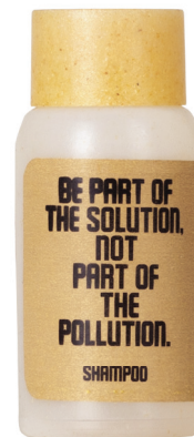
Shampoo 60 ml