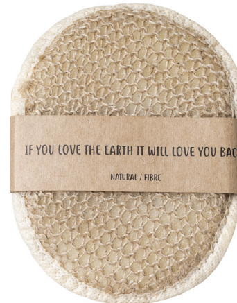
Natural Bath Puff