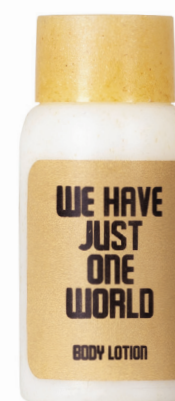
Body Lotion 60 ml