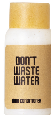
Hair Conditioner 60 ml