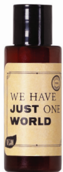
Body Lotion 35 ml