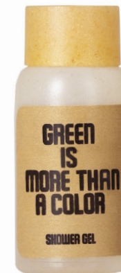
Shower Gel 60 ml