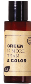
Shower Gel 35 ml